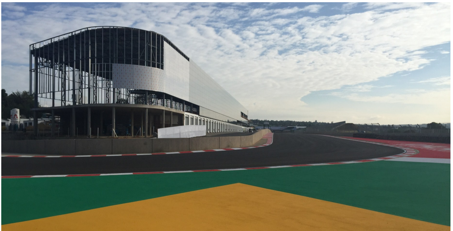
Ingwe corner with the new Kyalami Pit Building and International Convention Centre (under construction) in the background.