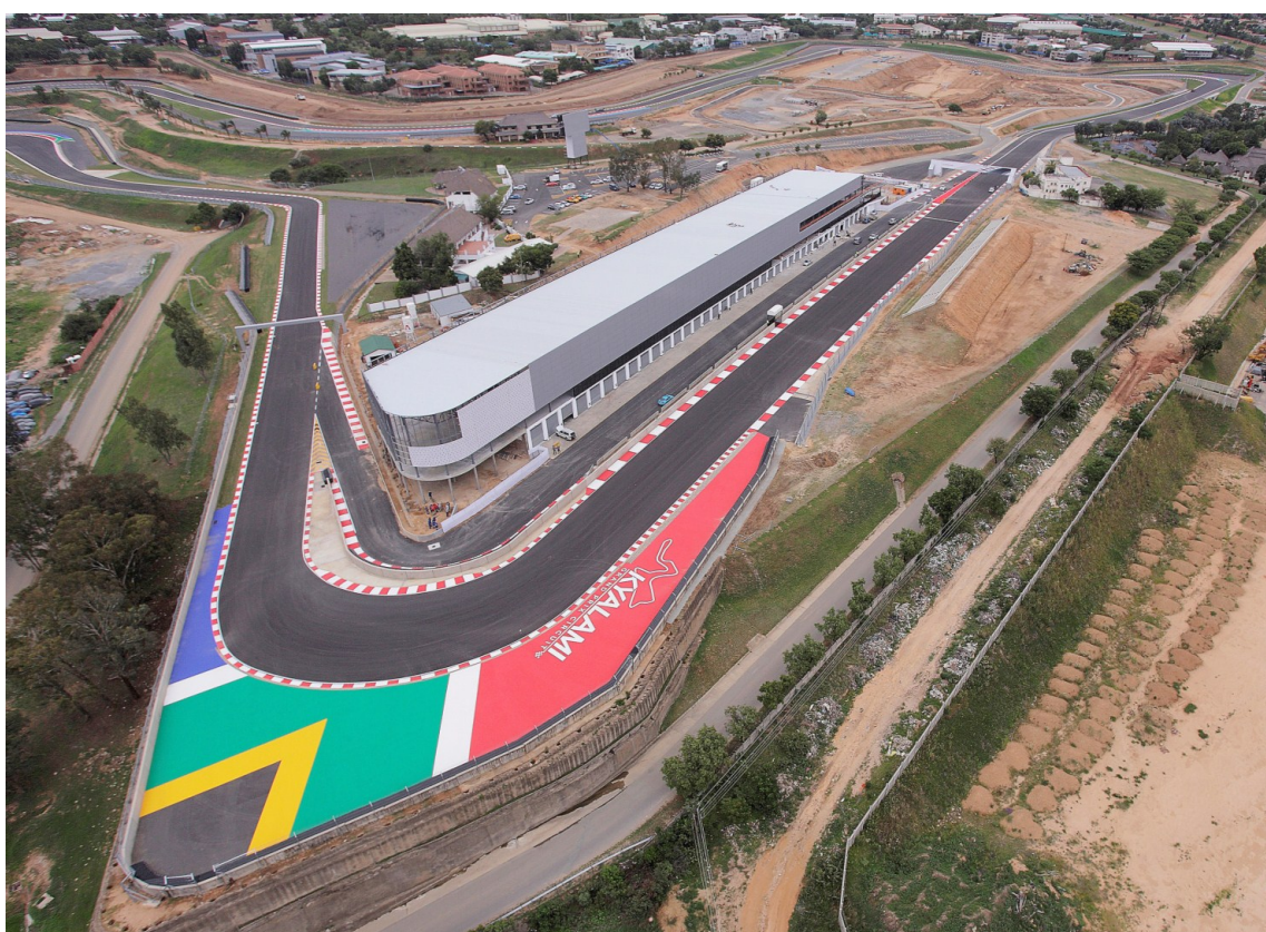
Aerial image of Ingwe corner and the impressive new Kyalami Pit Building and International Convention Centre that is still under construction.