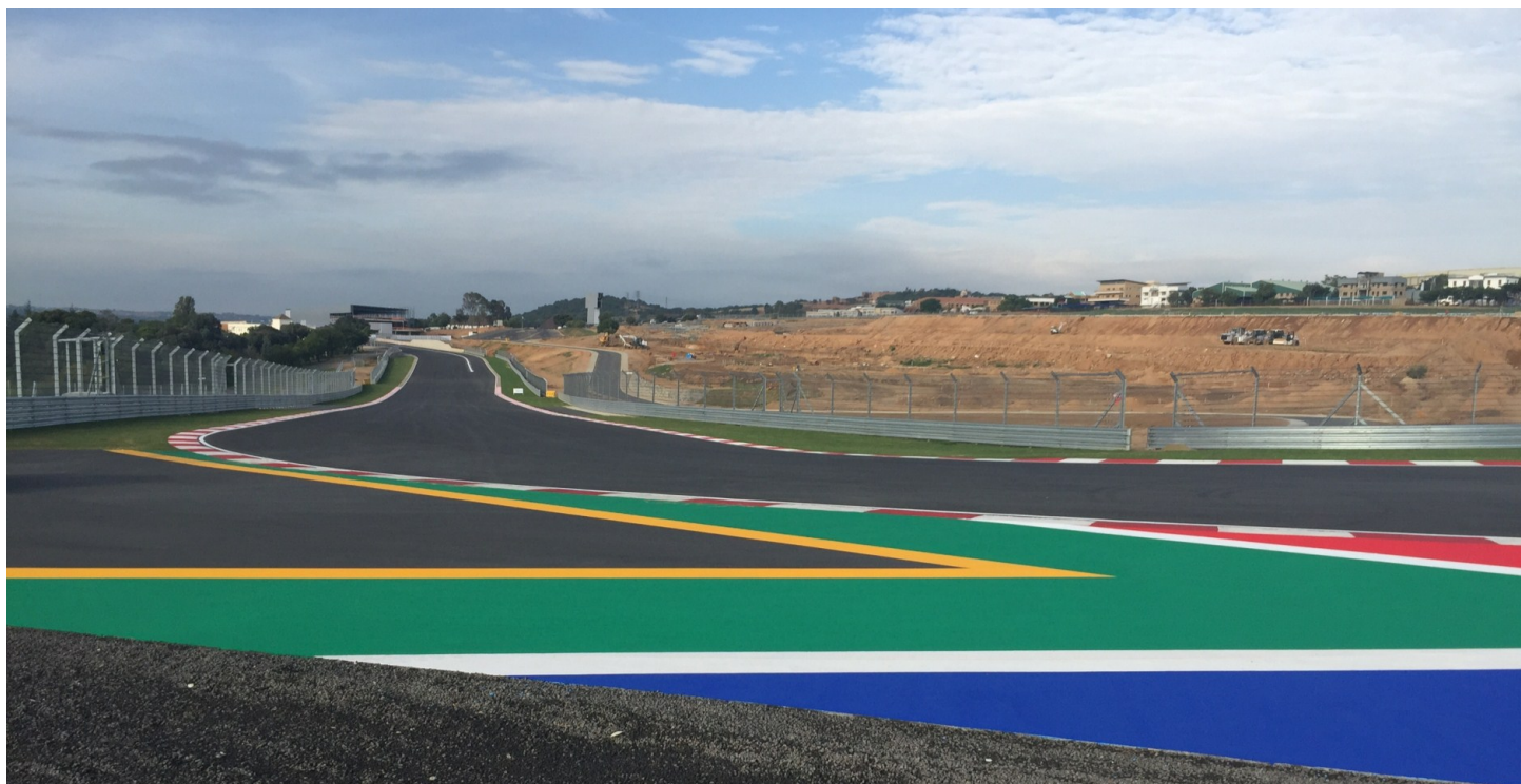
Main straight into Crowthorne corner with the South African Flag painted onto the asphalt run-off area.