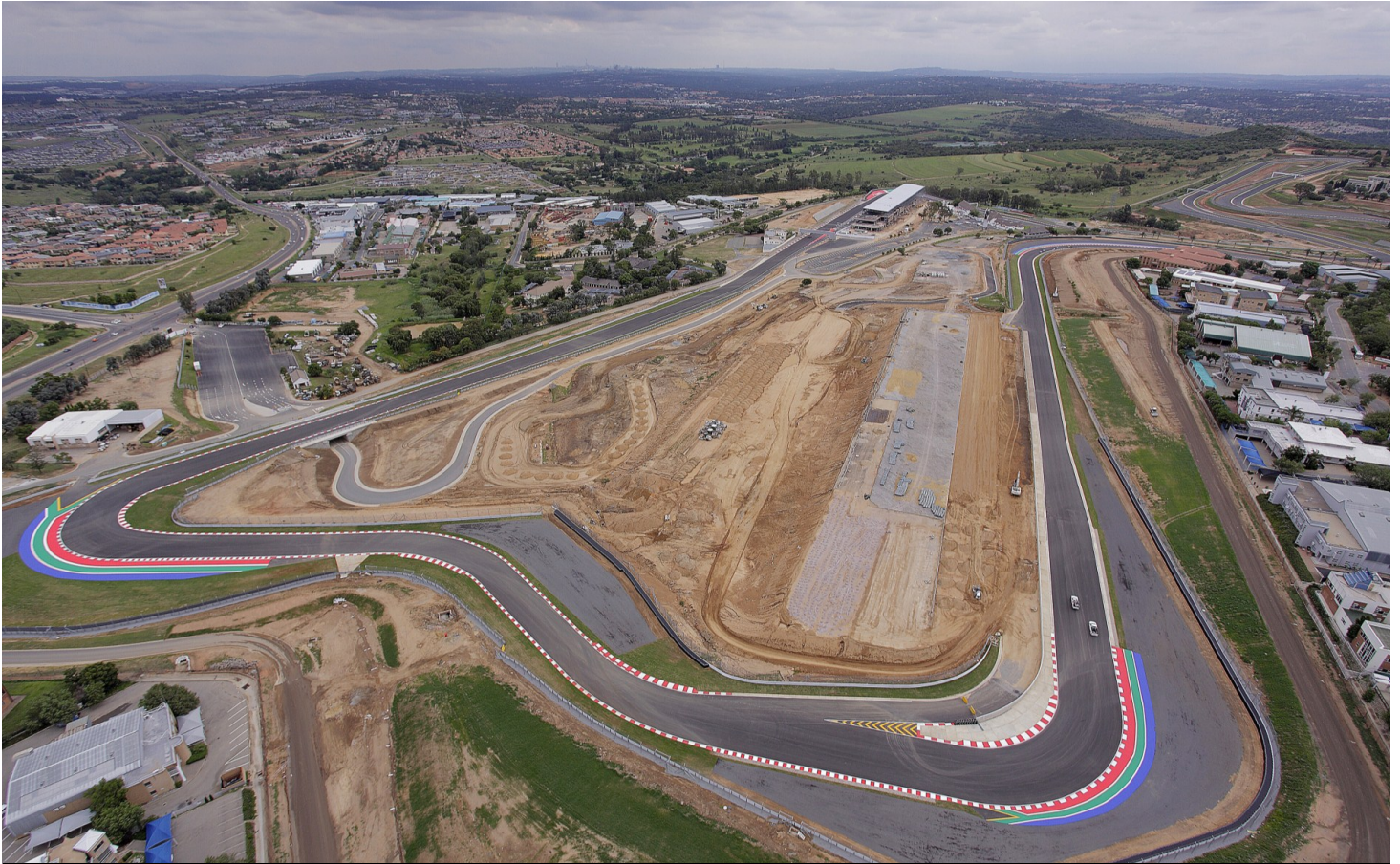
View of the circuit with Crowthorne, Jukskei and Barbeque in the foreground. Platforms and Handling Track under construction.