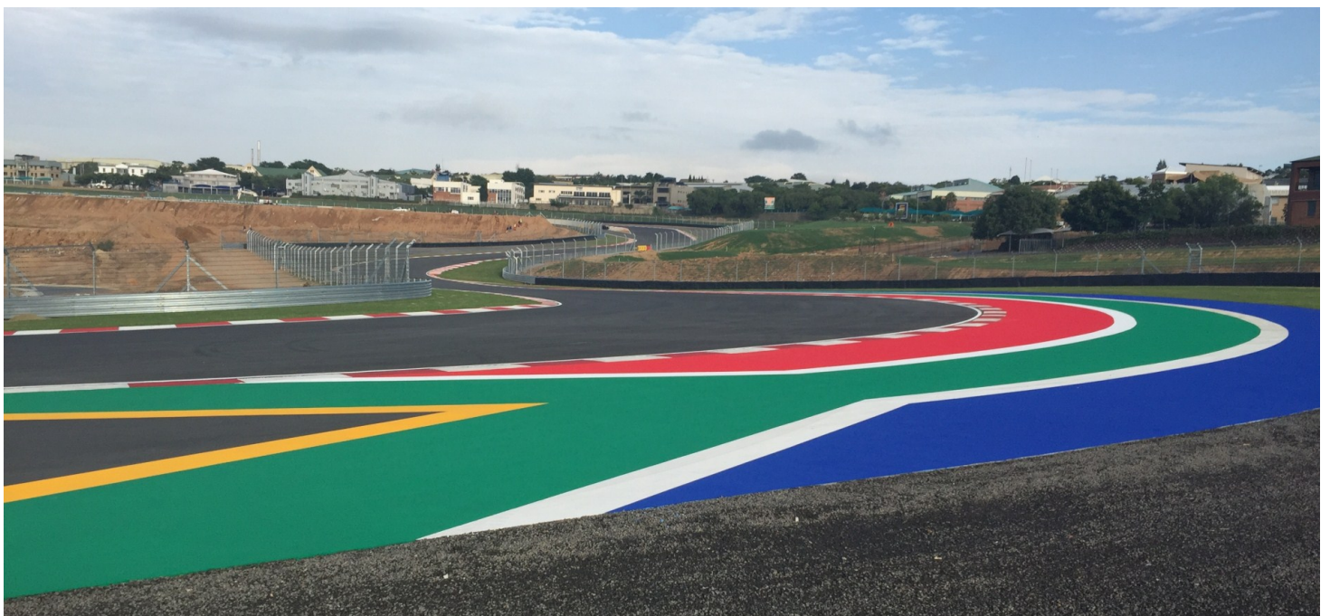
Exit of Crowthorne into Jukskei and Barbeque corners. South African flag painted on asphalt run-off area.